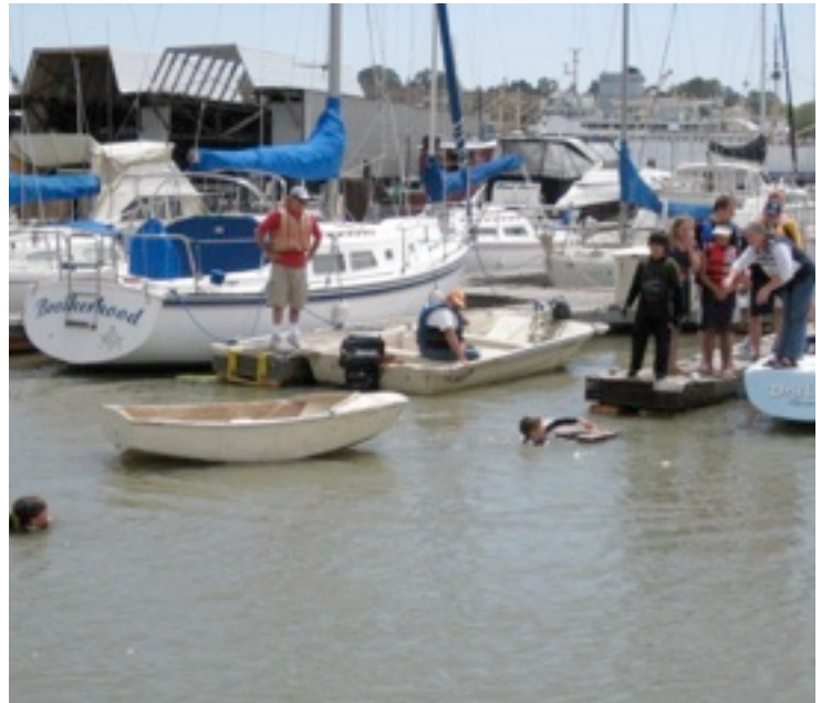
Learn to Sail students having fun in the sun.

Before the session starts each year I write an article for the Binnacle giving advance notice of class dates and where the classes will be held. Some how we still manage to upset a few people and I apologize for that. We are working on establishing a more neighbor friendly Learn to Sail.