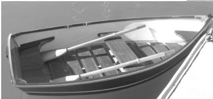
Don't miss the chance to bid on January 30th.

Restoration project pictures posted on the clubhouse bulletin board. Way to go Bruce!