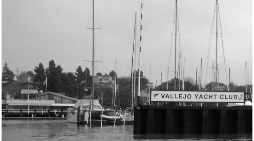
VYC's new new seawall and sign.