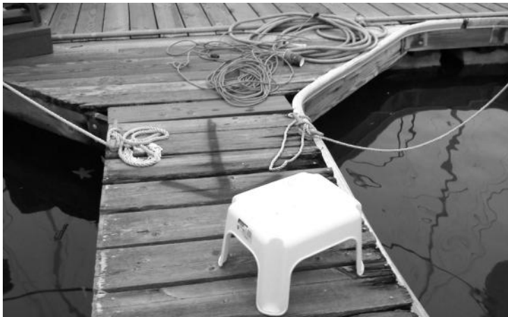
"These conditions are unsafe for all who use our facilities."

Please take some time to clean up the areas around your boat so we may all have a safe and happy harbor. Safety starts at home.