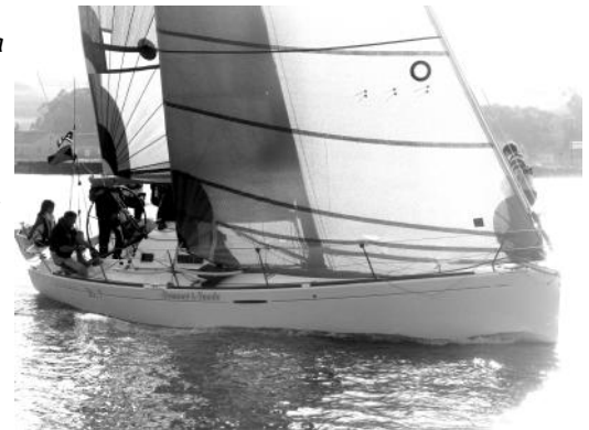
Summer and Smoke racing during the December 5th mid-winter race

Some gross results will show Degage leading in the spinnaker division and Lita-K with the honors in non-spinnaker. If you are considering racing in the mid-winter series, remember you get one throw-out so you can still be in the hunt. Our next race is on January 9 th , first start is div. A at 12:00. We are trying to get some shotgun shells. If that fails we will use air horns in the sequence.