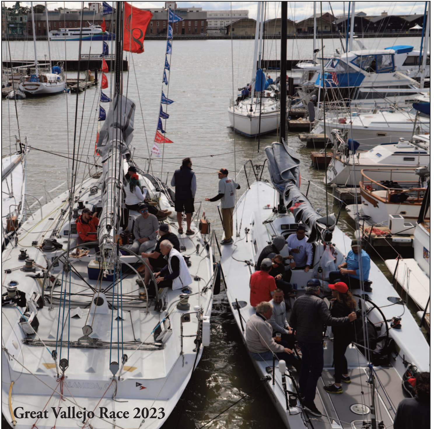
Great Vallejo Race 2023

P.I.C.Y.A. Club of the Year in 2015, 2014, 2013, 2012, 2010, 2009, 2008, 2007, 2006!