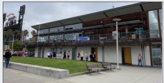
Photos from the South Beach Cruise out