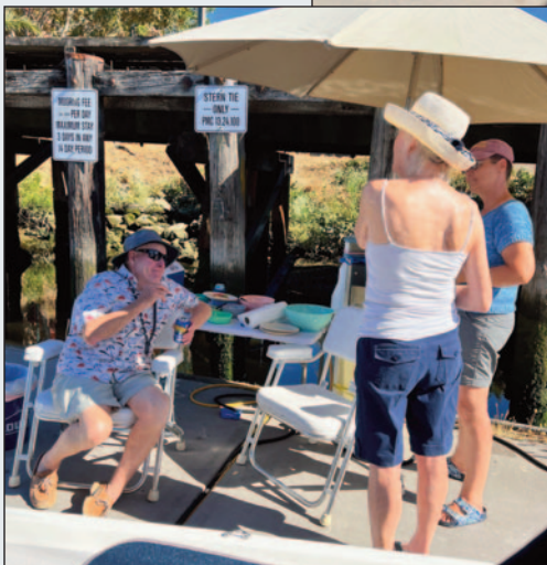
Dockside at the Petaluma Cruise Out