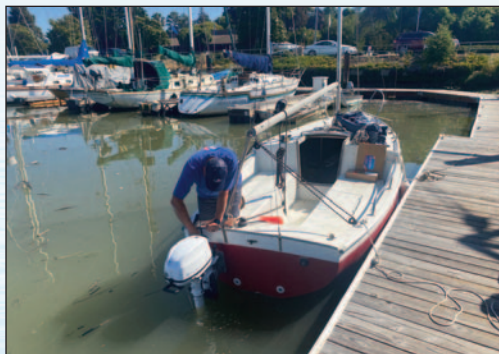
Boats in our Cal 20 Program