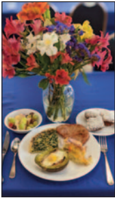
National Senior Citizen's Day Brunch

If you've exchanged burgees with another club, please send your picture and story to binnacleeditor@vyc.org .