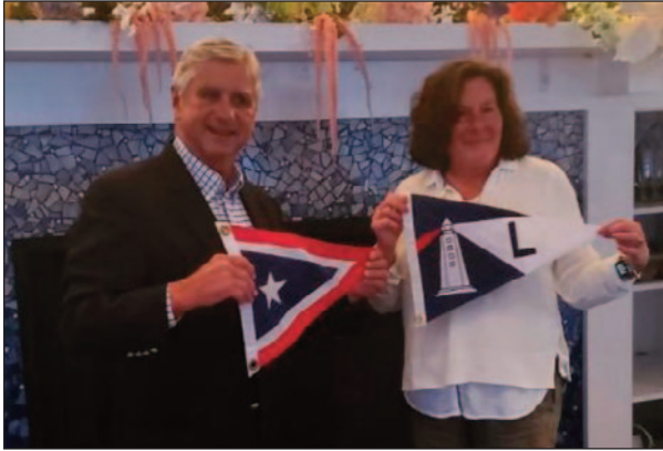
Exchange of burgees at the Lewes Yacht Club