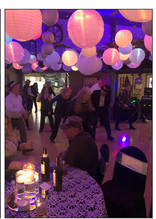
An Evening to Remember