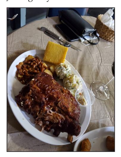
I'll take two, thanks!

The galley is open for business. Stop on down on a Friday night for some fine eats and a cold drink at the bar! Folks have been enjoying some of the amazing food coming out of Jim's galley....take a look at those ribs!