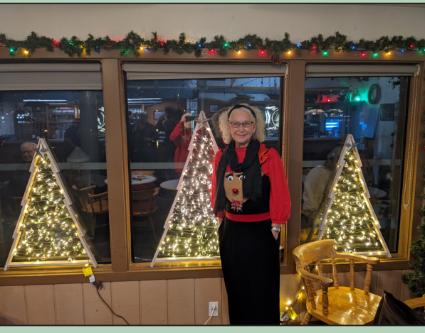
Lookin' Merry and Bright!